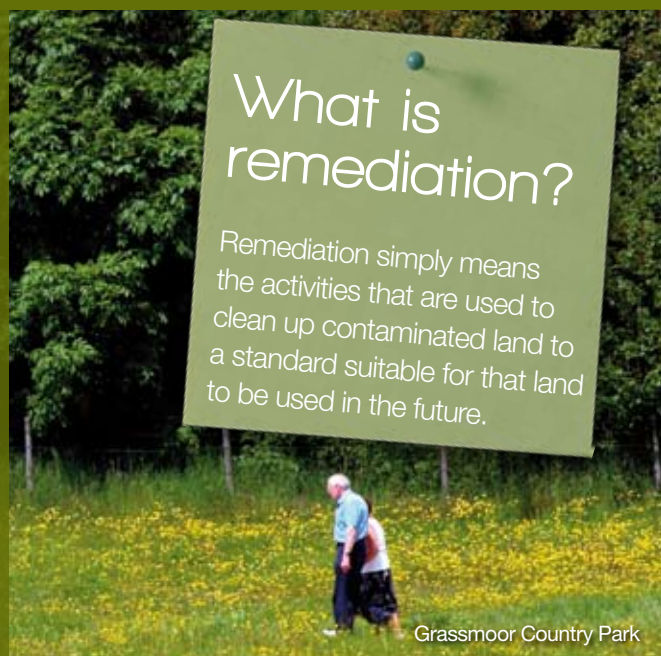
Grassmoor Country Park

The work will be carried out so that local residents and country park users are kept safe and disruption is kept to a minimum.